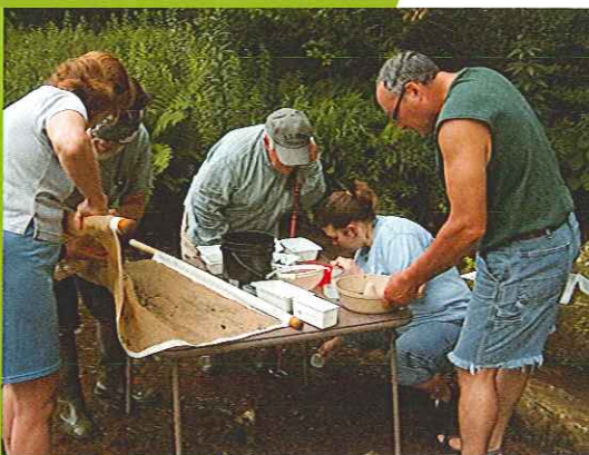
Macroinvertebrate Study at Jones Bridge, 2010

Financial Support for this project is provided by the Dominion Foundation which is dedicated to the economic, physical and social health of the communities served by the Dominion companies.